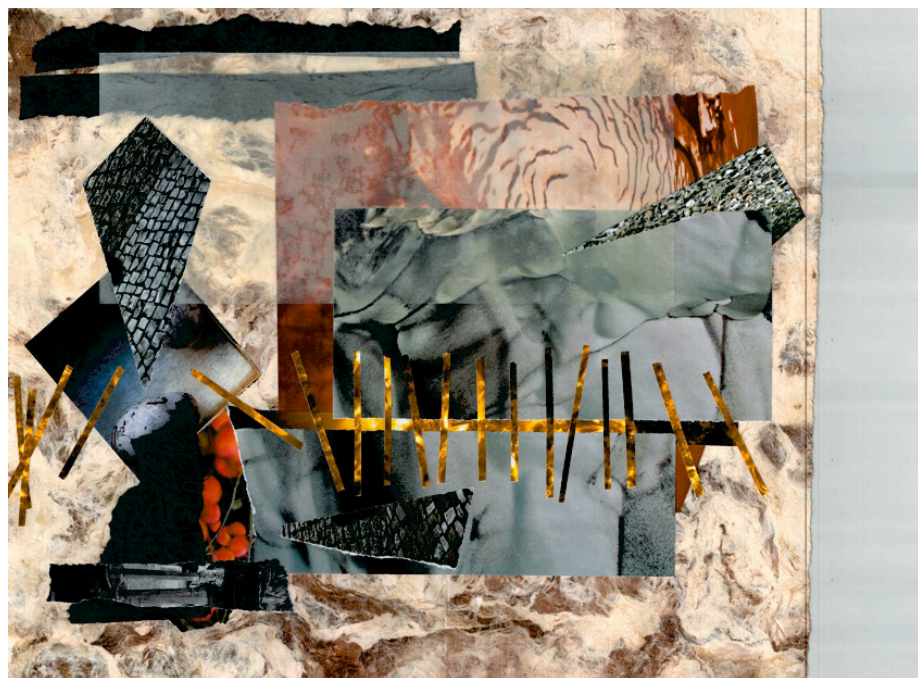
Bride price (2012)