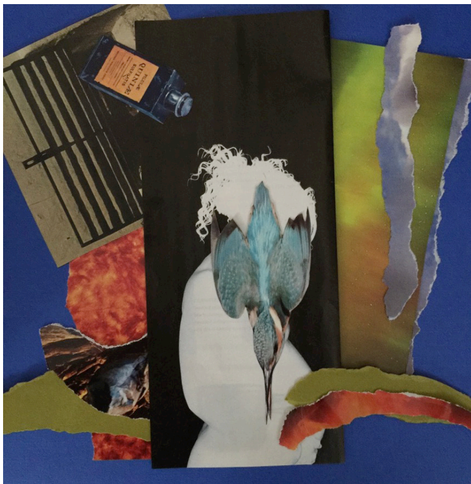
Humming sea (2015)