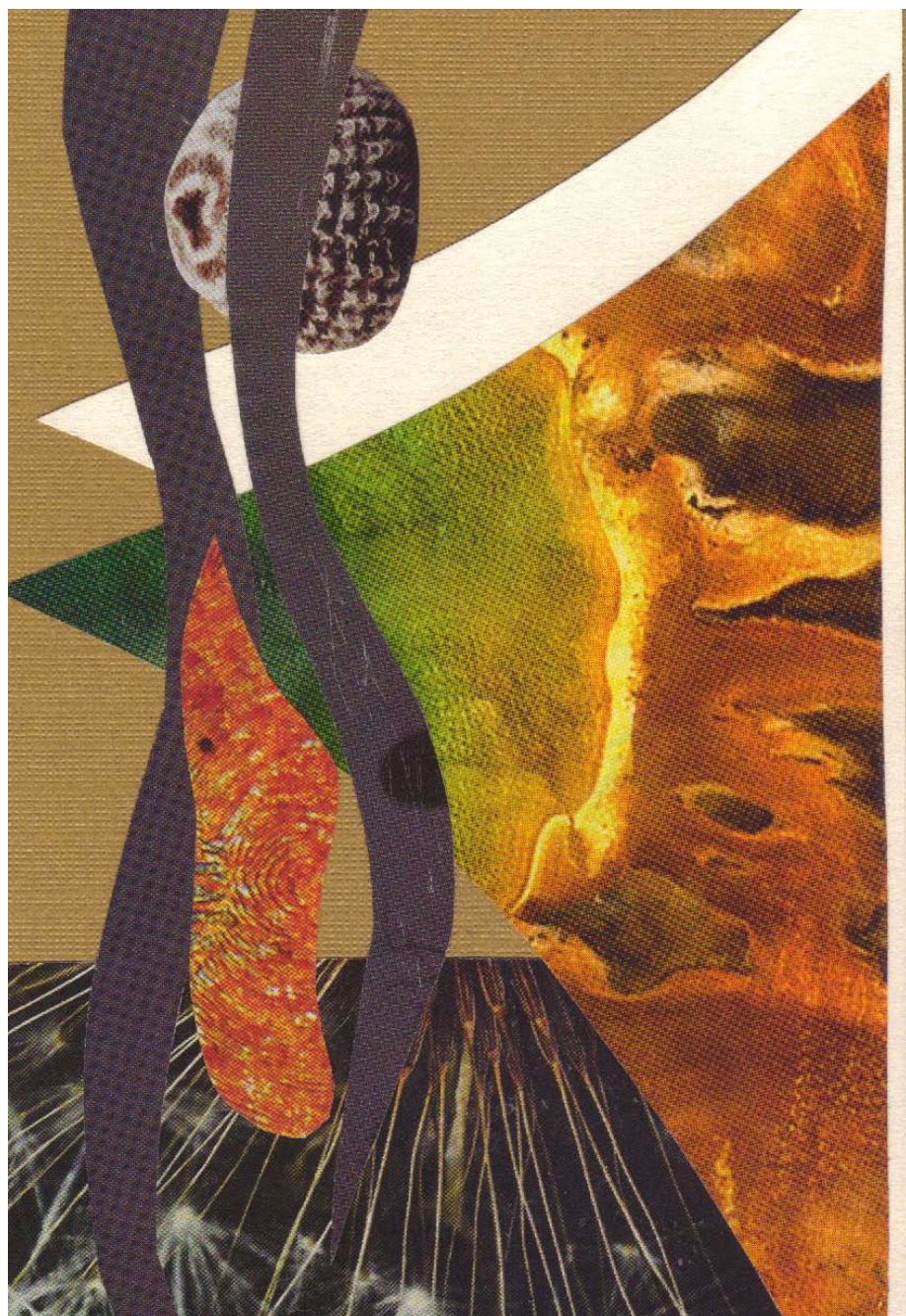
Geometries of fire (2010)