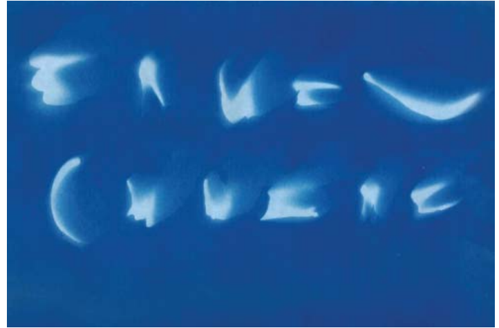
the roots, the dendritic swirls of letter forms. the serifs of teeth

i had hoped to make an alphabet of teeth, all the forms resting in boxes suggested it, as the roots of the teeth bend in ways that suggest meanings can be distinguished. The linguistic capabilities of a carnassial or incisor, whereas a molar seems bound / boulder / solid / vowel / in the middle of. The curl of beaver's incisor almost a "C" the teeth of homodonts become my vowels, my most common usages. come on homodonts! No variations, repeat after repeat, maybe size maybe all the tiny ornamental teeth of mammals make the best text. the deer's teeth are boxy, symbols of containment, of secrecy, uncanniness. The conical teeth of mississippiensis being common and pig teeth, half-tusks, stepping out, elaborately lengthy by comparison.